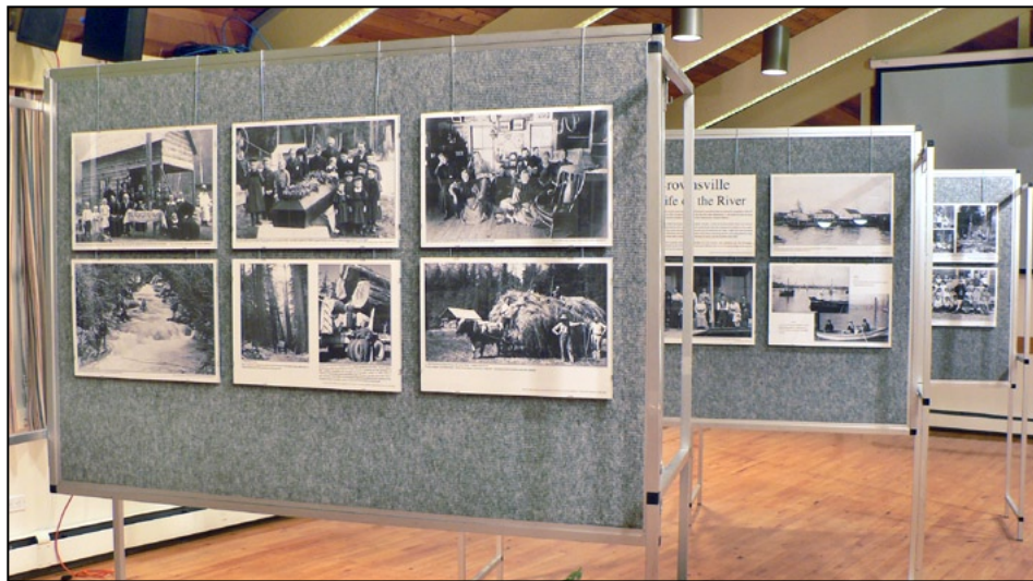
NORDIC SPIRIT: Norwegians in B.C.