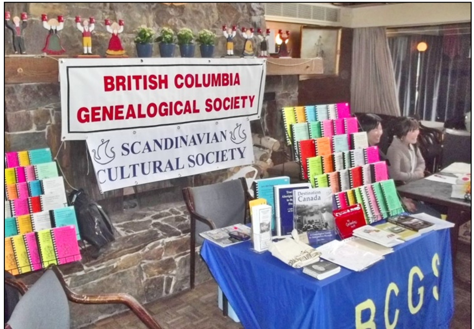
The BCGS had tables filled with books and other genealogical information at both the European and Midsummer Festivals.