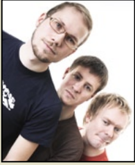
Traditional tunes from Rogaland. Concert & Dance.