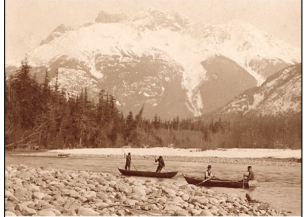
Early Norwegian Immigrants in B.C.

The Scandinavian Cultural Society is pleased to present Nordic Spirit 2011